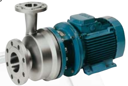
WHP+ High Pressure