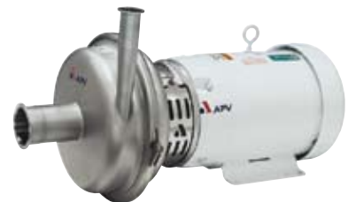
WI+ Universal Inducer