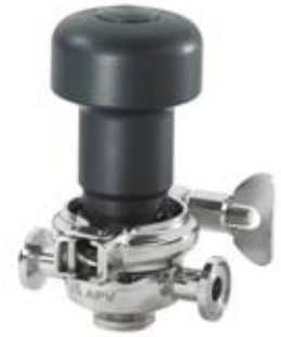
Delta AP1 Econo Line