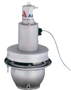
VRA & VRAH

APV's VRA and VRAH valves are the reliable solution anywhere there needs to be vessel or tank protection against vacuum.